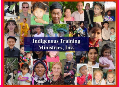
Indigenous Training Ministries, Inc.